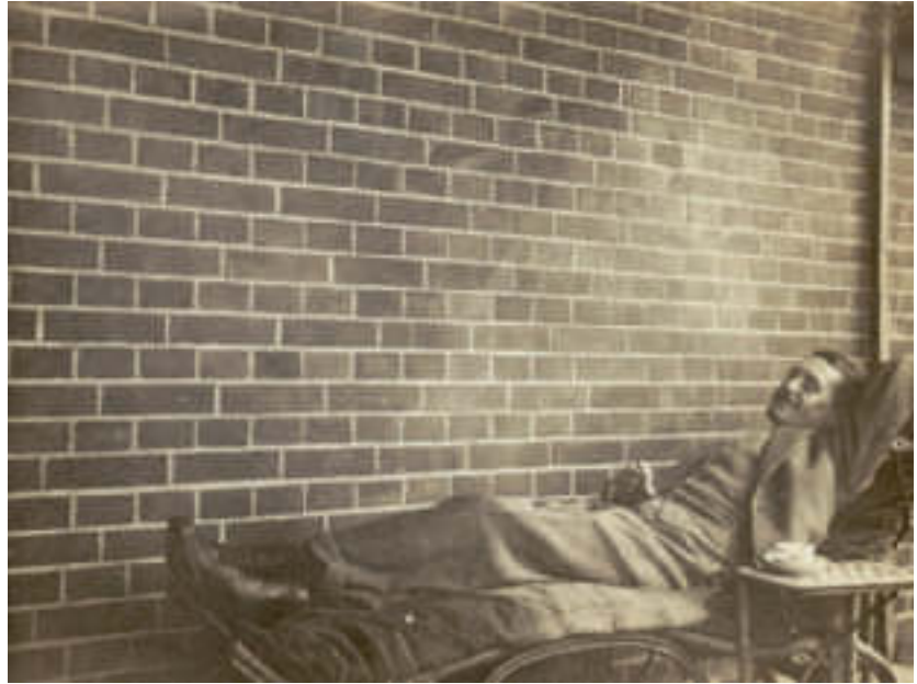
Walter Gropius during a visit to his uncle in Janikow, Pomerania, in 1910, the year in which he opened his own architectural office.

points of contact. Van de Velde's request to put his name forward as a successor reached Lieutenant Gropius on the battlefield. He thought that as a homo novus he hardly stood a chance, but replied to Weimar accepting the nomination. But for the time being, the further development of this promising story was prevented by the war.