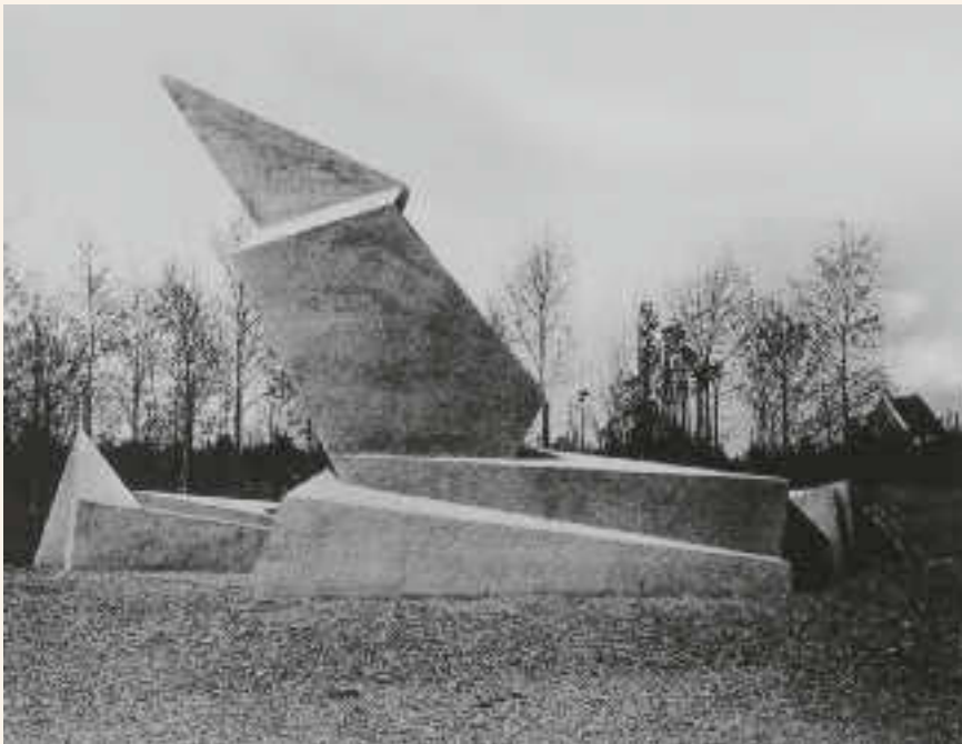
This memorial to the workers murdered in the Kapp Putsch of March 1920, built in 1922 to a design by Walter Gropius at the Cemetery of Honor in Weimar, is distinguished by its Expressionist language of forms.

The Bauhaus was unique, avant-garde, and pursued a path that led purposefully toward Modernism. Its members practiced an anti-academic education, had a concept of utopia and sought the mankind of the future, for whom they wanted to design according to need. Before the Bauhaus there had admittedly already been various reformist approaches to, and ideas on, education and art. But the Bauhaus was unique because it concentrated these aspirations and made them into reality.