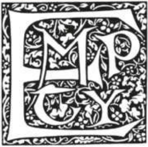
Gothic overtones: “Empty,” designed in 1896 by William Morris for a book illustration.

→ The Multitalented William Morris , a follower of Ruskin, for whom the arts—as for Ruskin—are based on the crafts. Morris, a socialist, wanted to create “from the people for the people.” The Arts and Crafts Movement, which he founded, strongly influenced the reforms in the crafts in the Art Nouveau period (known as Jugendstil period in Germany).