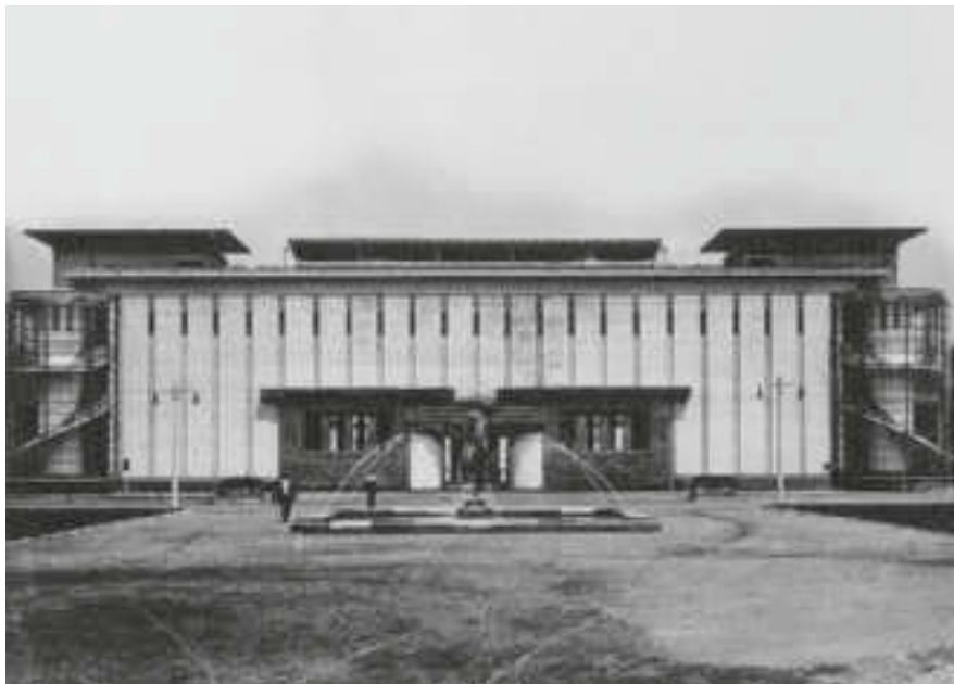
The office building for the pattern factory designed by Walter Gropius and his partner Adolf Meyer, with side stairwells entirely of glass, at the Deutscher Werkbund exhibition in Cologne, 1914.

wards, together with his colleague Adolf Meyer, he designed a new factory building for the Fagus shoe-last factory at Alfeld, near Hanover. Here, turning away from the reiteration of historical styles, Gropius created something truly new, for the glass exterior walls of the factory were largely freed from their load-bearing and supporting function. A revolutionary glass façade of this kind was later to become a significant characteristic of the Bauhaus building in Dessau. Also in 1910, Gropius became a member of the Deutscher Werkbund (German Work Federation, an association of artists, designers, architects, and industrialists) and, as a committed young comrade-in-arms, he worked on its yearbooks. When, at the Werkbund exhibition in Cologne in 1914, a scandal broke out—the so-called “Werkbund dispute”—Gropius took sides with the established figure van de Velde. The cause of the dispute was a controversy between van de Velde and the architect Hermann Muthesius that nearly caused the breakup of the Werkbund. While Muthesius spoke out in favor of standardization in architecture and the industrial production of furniture