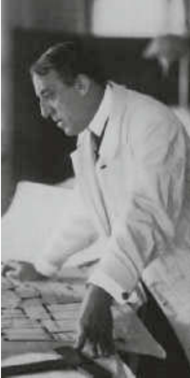
In 1906 Henry van de Velde founded the Grand Ducal Saxon Arts and Crafts School in Weimar, of which he was director up to 1915.