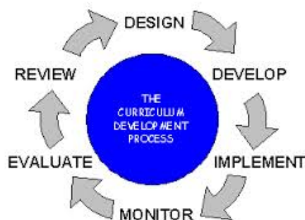
Figure 1 Curriculum Development Process

understand lectures while using their smartphones, listening to music or watching a YouTube video on their laptop or iPad. Prensky (2001) argues that these digital immigrant lecturers did not practice this skill during their formative years but instead learnt skills of listening to lectures, taking notes, reading books, newspapers and journals which most digital natives lack.