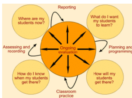
Figure 2 Graded Structure or Ongoing Evaluation

Integrating social media in social work curriculum will have the effect of increasing levels of technological developments and technological competences of students (Young, 2018). The Curriculum Development process of integrating social media in social work curriculum will require a “multi-step, ongoing and cyclical process” (Institute of Progressive Learning.org). This process starts with an evaluation of the current programme for implementing the new programme and back to evaluating the revised programme (Institute of Learning and Education.org). Figure 1 above is an illustration of this process. The on-going evaluation is also known as the Graded Structure (see Figure 2 below). The social media tools that would be considered for such a curriculum are: (a) social networking sites (such as Facebook, Twitter, WhatsApp and LinkedIn), (b) media sharing sites (YouTube, Vimeo, and Flickr), (c) content creation and publishing tools (wikis and blogs), and lastly (d) internet messaging sites (Google Hangout, Skype, WhatsApp, and Facebook Messenger).